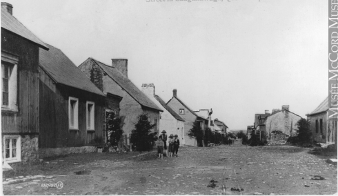
Street in Caughnawaga, Que. : Iroquois Indian Reserve