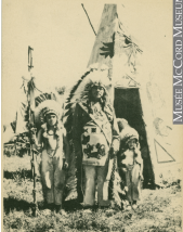
CHIEF POKING FIRE - GRANDSONS - YOUNG POKING FIRE & RED PATHFINDER: CAUGHNAWAGA, CANADA, --